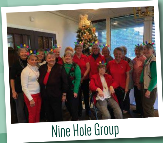
Nine Hole Group

The Ladies Nine Hole Group celebrated their Christmas party on December 7 th in the Dogwood Room and a good time was had by all!